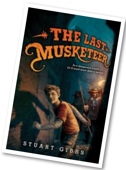
The Last Musketeer Stuart Gibbs

Are you looking for a good book for a holiday gift? Here are three of our newest books in the Skokie Collection: