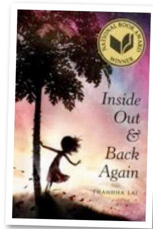
Inside Out and Back Again By Thanhha Lai

This hilarious book is the 2012 Newbery Gold Medal winner. At the beginning of the summer, Jack finds himself grounded forever! He wonders if he can possibly salvage his summer. Jack is afflicted by frequent nosebleeds. His nose gushes whenever he is upset. Unfortunately, when he is forced to help an elderly woman, he is placed in many tense situations. Jack wonders if he will ever survive 1962!