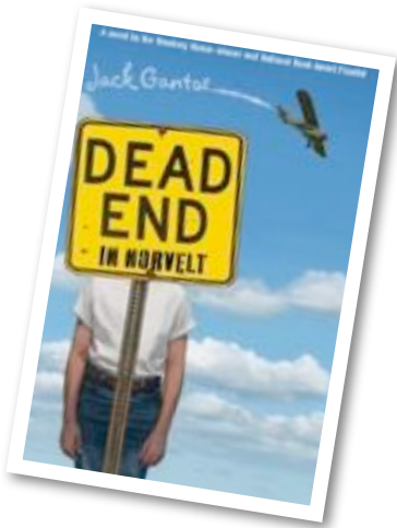
Dead End in Norvelt By Jack Gantos

As the newspapers indicate, we are now in the awards season. This week, the American Library Association announced the 2012 Newbery Award winners. The Newbery Award recognizes the authors who have made the greatest contribution to American children's literature this year. The Schneider Award recognizes the book, "...that embodies an artistic expression of the disability experience for child and adolescent audiences." The winner of the Schneider Award was also declared this week.