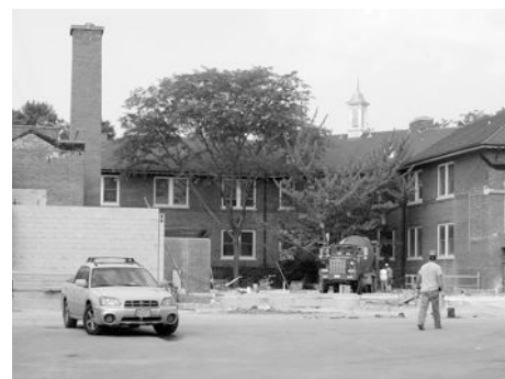
A new 2-story addition to Greeley School is under construction.

Washburne students have new drop-off and pick-up locations this year. Students and parents have been notified of the specifics of these new plans and that safety monitors will be present as needed to assist students in crossing streets. Outdoor Kinetic Wellness classes will use the Winnetka Park District fields north of the park district offices.