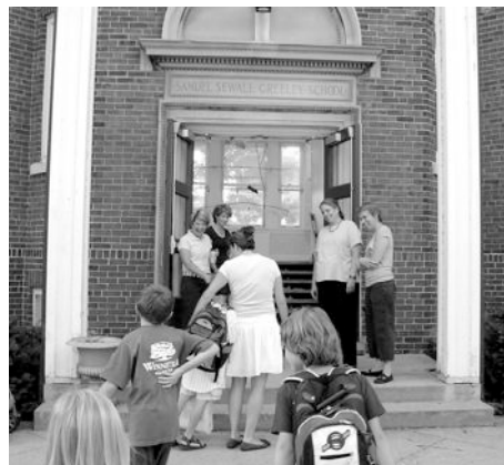
Greeley teachers and staff welcome students on opening day.