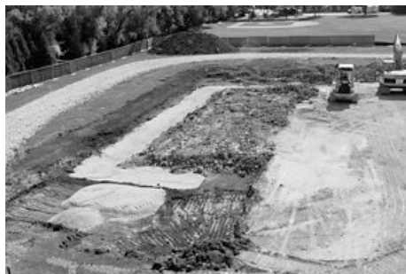
Temporary construction road that circles the site of Washburne School's new addition.

the building has been torn down and will be replaced with a two-story addition, closely matching the 1913 architectural